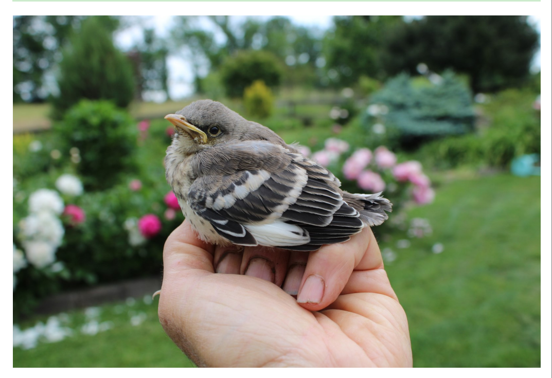
The Mockingbird successfully bred for the first time at the field station, where it nested in the garden holly tree at the upper right in this photo.

The Mockingbird family, the Mimidae, is a New World family of perching Among members of the family are some that mimic the of other bird calls species. One of these mimics is a new nester at the field station-the Northern Mockingbird. A successfully produced young, one of which is in the image above.