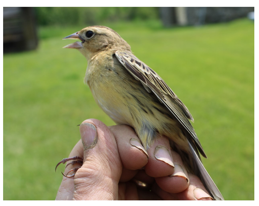
This female Bobolink was the first of its species to breed successfully in the field station hayfield.

The BCR field station has been undergoing intensive management for years. During that time, have we greatly diminished the extent to which invasive exotic plants have extended into what was once hayfield. As these were removed, we planted valued forage grasses like red fescue (Festuca rubra, orchard (Dactylus grass glomerata) and timothy (Phleum pratense) replace the alien shrubs. As a consequence, our hayfield is much more extensive than it once was.