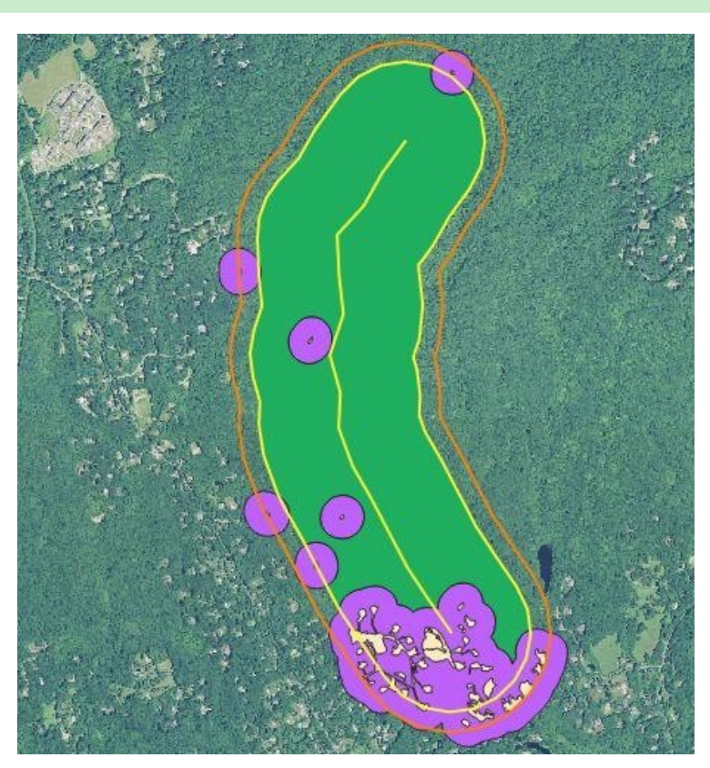
This study site in Weston, CT shows the central yellow line of the survey transect and the 800 m wide corridor around it used for making landscape measures. The bright green is core forest and the purple is forest not within core forest. The pink areas are roads, houses and other non-forest habitats.

"This study performed a comparative analysis of four landscape measures to determine if any one predominated in influencing the structure of bird communities."