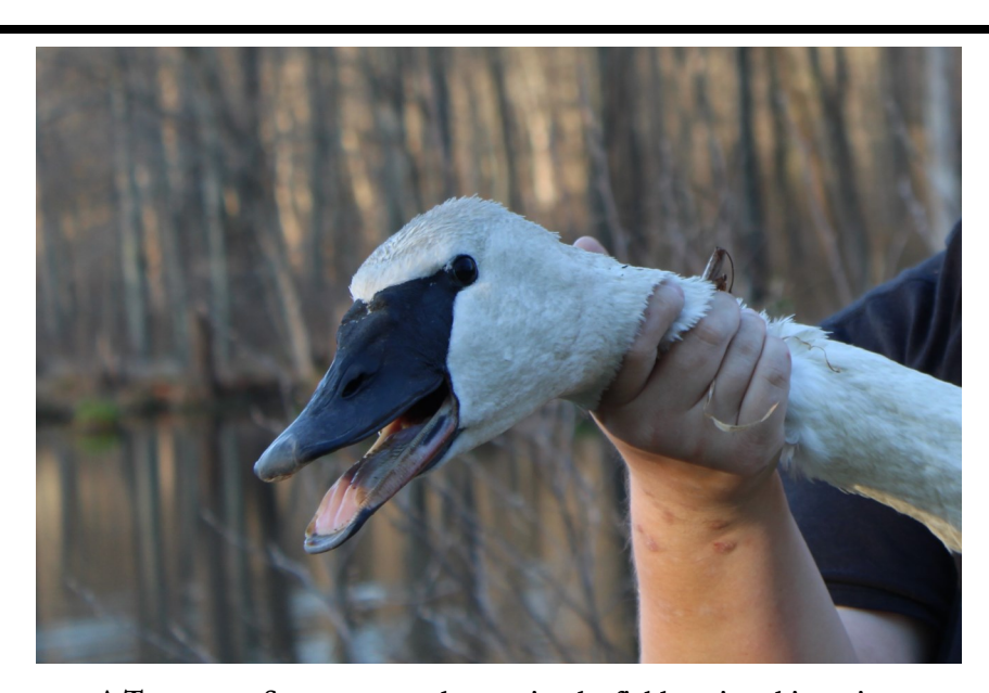
A Trumpeter Swan appeared opposite the field station this spring.